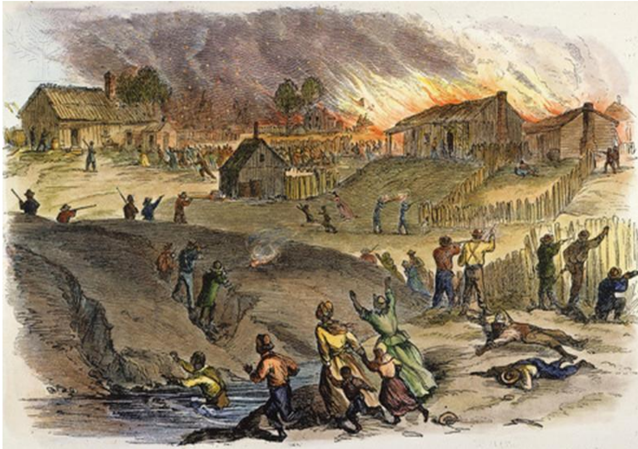
TENNESSEE: RACE RIOT, 1866. - The race riot at Memphis, Tennessee, on 1-2 May 1866. Contemporary American wood engraving. / Credit: The Granger Collection / Universal Images Group / Copyright © The Granger Collection / For Education Use Only. This and millions of other educational images are available through Britannica Image Quest. For a free trial, please visit www.britannica.co.uk/trial

Source H: A woodcut showing events in Memphis, Tennessee, on 2 nd May 1866