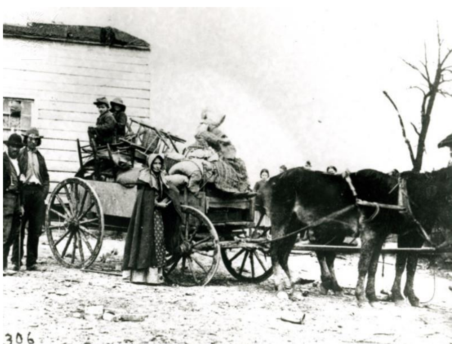
USA, Civil War, refugee family, photo. / Credit: akG Images / Universal Images Group / Copyright © AKG Images / For Education Use Only. This and millions of other educational images are available through Britannica Image Quest. For a free trial, please visit www.britannica.co.uk/trial

A family leaving their home in the South as the fighting approaches