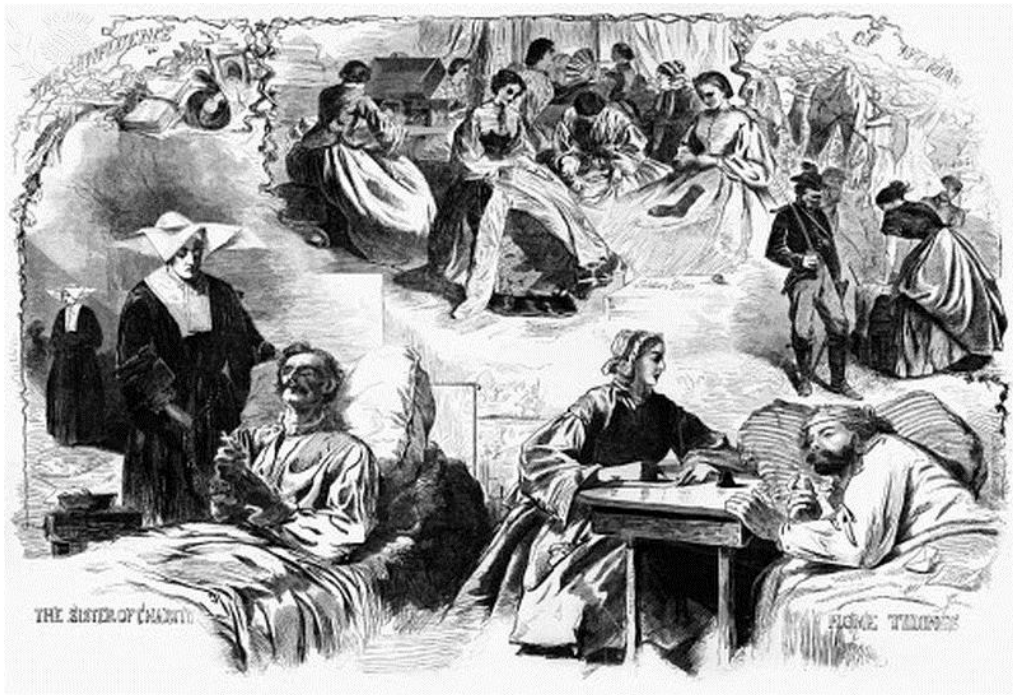
CIVIL WAR: WOMEN, 1862. - 'The Influence of Woman.' Composite of scenes of women sewing and doing laundry for soldiers, a nun visiting a wounded soldier and a woman writing a letter, during the American Civil War. Wood engraving, 1862 / Credit: The Granger Collection / Universal Images Group / Copyright © The Granger Collection / For Education Use Only. This and millions of other educational images are available through Britannica Image Quest. For a free trial, please visit www.britannica.co.uk/trial

1862 woodcut entitled 'The Influence of Women'