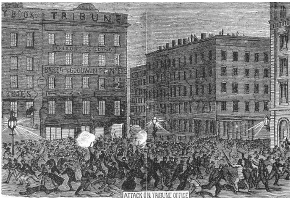
NEW YORK: DRAFT RIOTS, 1863. - A mob of rioters attacking the offices of the 'New York Tribune' during the New York City Draft Riots of 13-16 July 1863. Contemporary American wood engraving. / Credit: The Granger Collection / Universal Images Group / Copyright © The Granger Collection / For Education Use Only. This and millions of other educational images are available through Britannica Image Quest. For a free trial, please visit www.britannica.co.uk/trial

Anti draft riots in New York in 1863 after Congress passed a new conscription law.