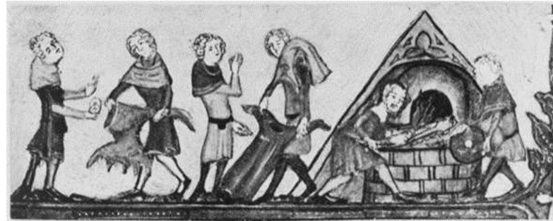
Source 1: This image is from the late 14th century. It shows the clothes of Black Death victims being burnt in medieval Europe, circa 1348.

What can you see in, or infer from, the source? Hint: Focus your thinking on ideas about the spread of disease, understanding of cures, and the impact of disease.