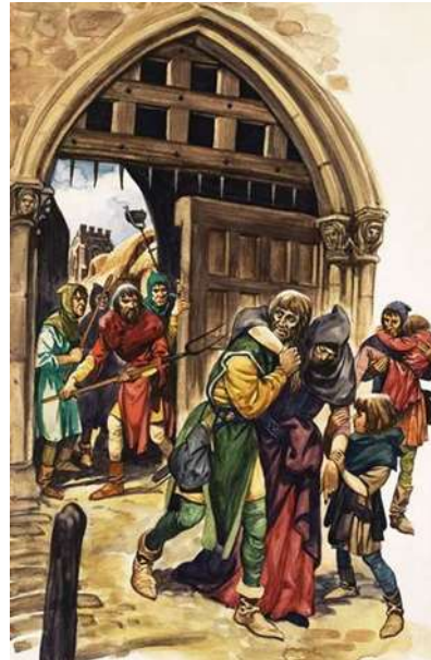
Source B: 'The Terrible Plague': Townsfolk driving out a man and his sick wife along with a man and his sick child, both suffering from the plague. From a 20 th century children's book.

What can you see in, or infer from, the source? Hint: Focus your thinking on ideas about the spread of disease, understanding of cures, and the impact of disease.