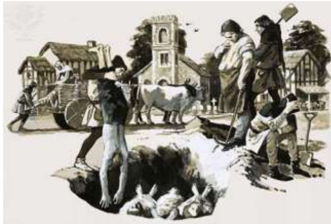
Source D: An image from a 20 th century children's book showing plague burials in the city of Norwich in 1349.

What can you see in, or infer from, the source? Hint: Focus your thinking on ideas about the spread of disease, understanding of cures, and the impact of disease.