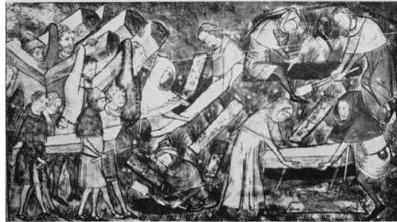
Source C: Victims of the Black Death being buried at Tournai, then part of the Netherlands, 1349. The Black Death was thought to have been an outbreak of the bubonic plague, which killed up to half the population of Europe.

What can you see in, or infer from, the source? Hint: Focus your thinking on ideas about the spread of disease, understanding of cures, and the impact of disease.