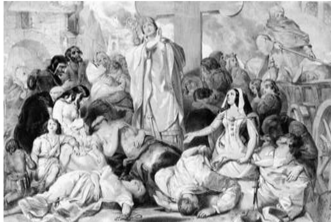
Source E: This is a 19 th century picture which shows people praying for relief from the Black Death, circa 1350

What can you see in, or infer from, the source? Hint: Focus your thinking on ideas about the spread of disease, understanding of cures, and the impact of disease.