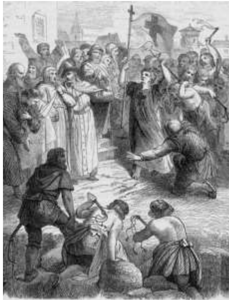
Source A: A 19 th century German engraving showing a group of flagellants in the mid-14 th century.

What can you see in, or infer from, the source? Hint: Focus your thinking on ideas about the spread of disease, understanding of cures, and the impact of disease.