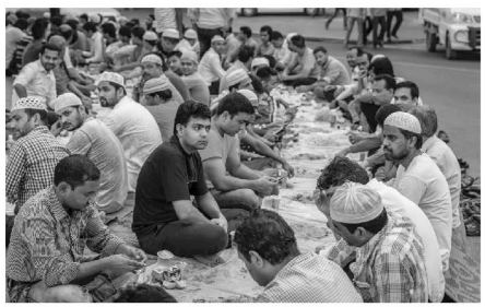
Süße Spezialitäten - das Zuckerfest in einer Berliner Straße

Muslimische Gemeinden in Deutschland teilen ihr größtes Fest mit ihren Mitbürgern.