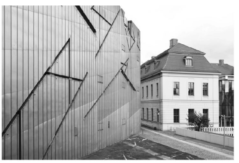
Alter und neuer Teil des Museums