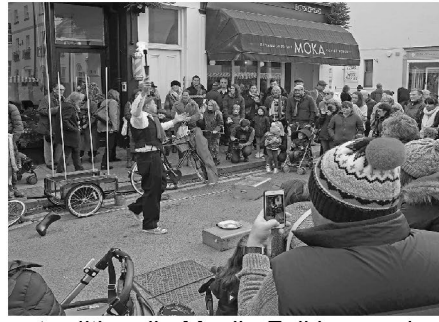
traditionelle Musik, Folklore und Tanz in Hamburg