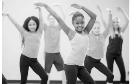
Tanzgruppe ,Dance Moves Kids

Der Unterstützerkreis ,Asyl Pappenheim' veranstaltet kostenlose Begegnungsfeste in der Stadthalle.