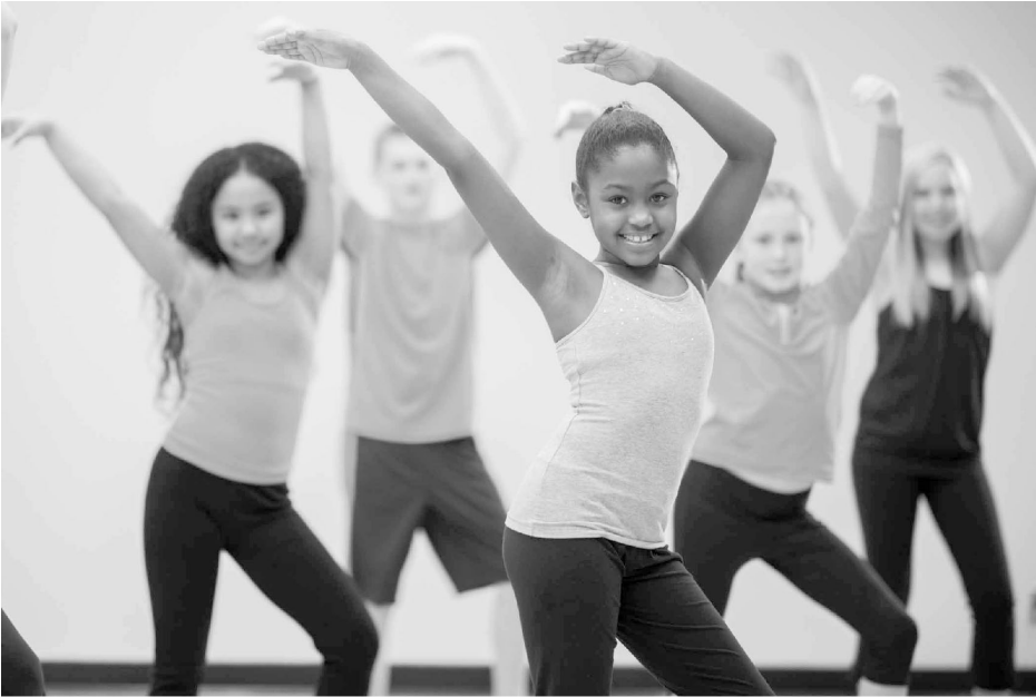
Tanzgruppe ‚Dance Moves Kids‘