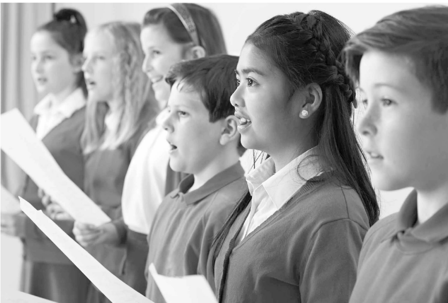
Kinderchor: „Wir singen ein Lied für die Freiheit.“