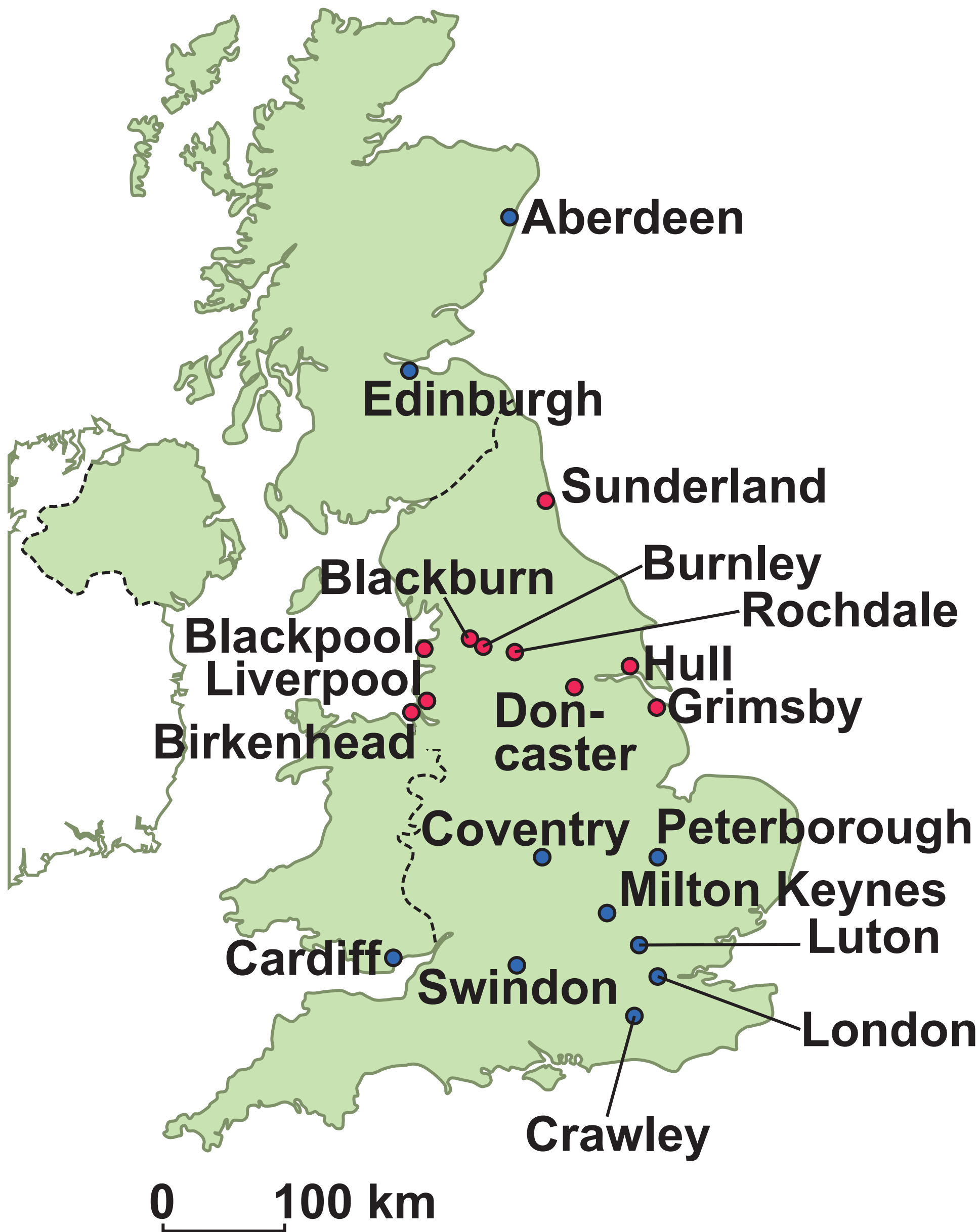
FIGURE 5 for use with Question 1