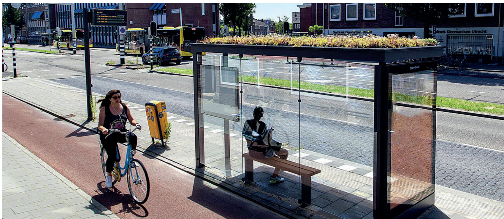
FIGURE 3 for use with Question 1

An image shows a bus stop. The roof of the bus stop is covered in plants.