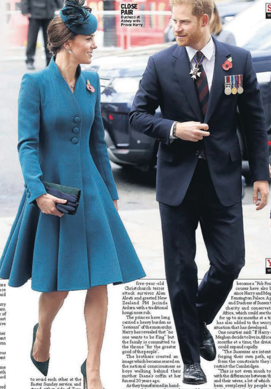
CLOSE PAIR Duchess at Abbey with Prince Harry