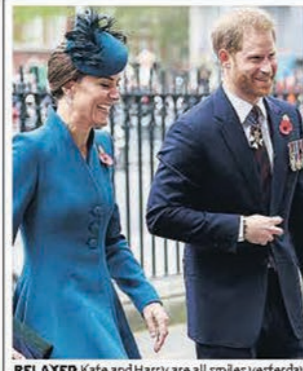
RELAXED Kate and Harry are all smiles yesterday

She is behind 'olive branch' Windsor meeting